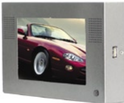
AD Series 7" model

The AD Series is being distributed worldwide through both existing and new distribution channels.